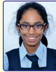
Uktasri D Grade : 9 Merit Certificate